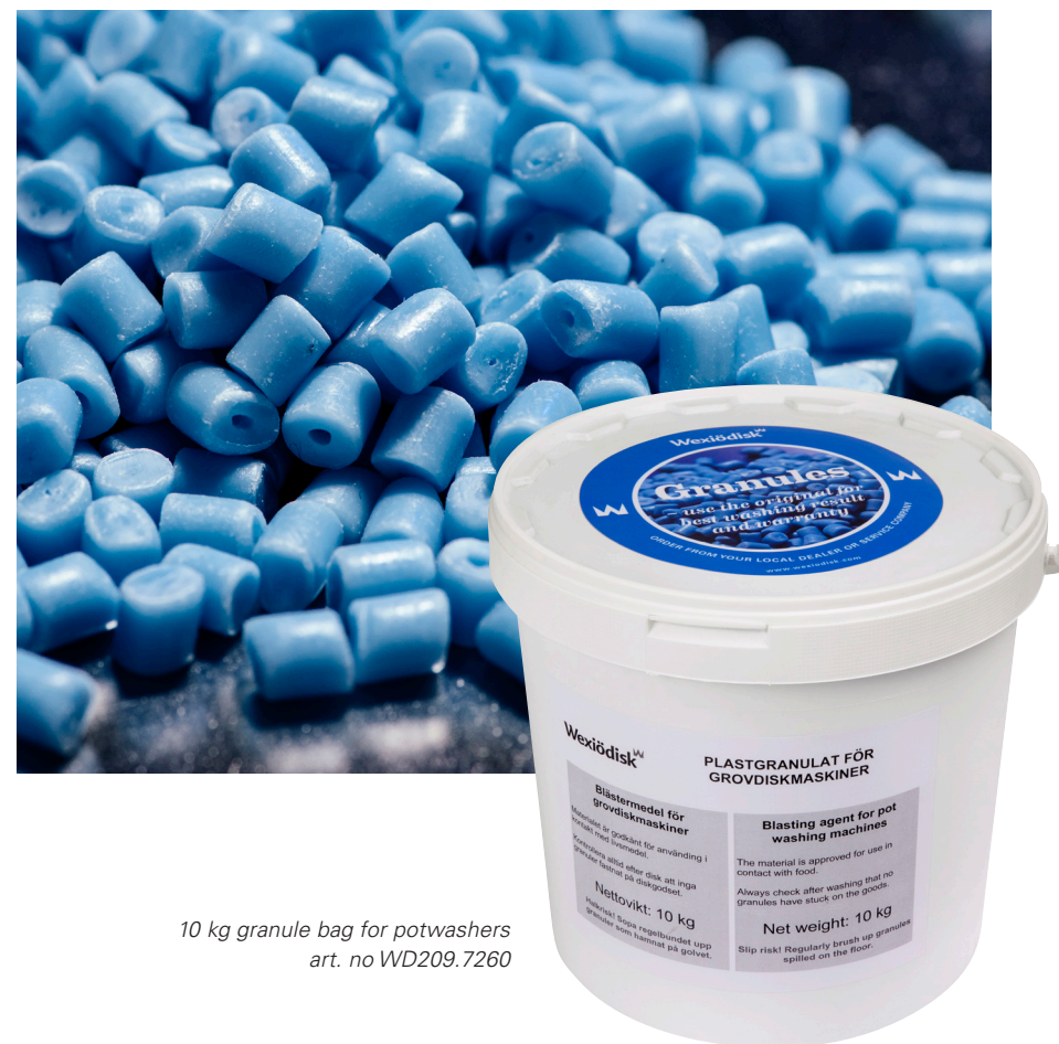
10 kg granule bag for potwashers art. no WD209.7260