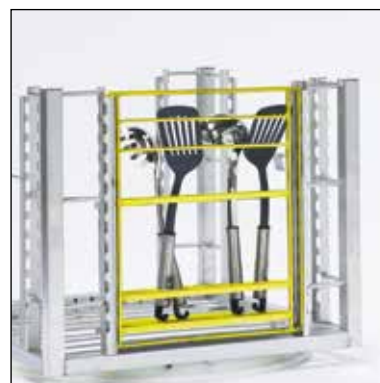
Utensil holder, part. no. 209.7277