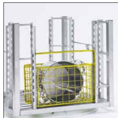
Wire basket, part. no. 209.7278