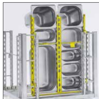
Holder for 1/3, 1/6, 1/9 containers, part. no. 209.7282