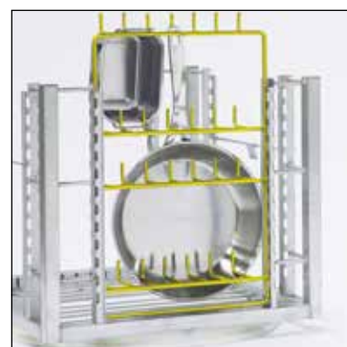
Allround holder, part. no. 209.7273 For pots with handles and ABC- containers.