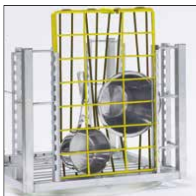
Flexible insert, part. no. 209.7281 Used together with side holder. Included in the delivery.