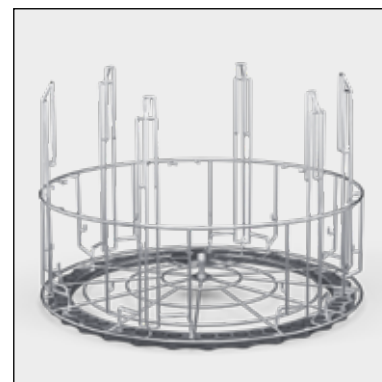
Sous vide basket. part. no. 209.7291

The above accessories are a selection of Wexiödisk range. Additional equipment for other kind of dishes can be requested.