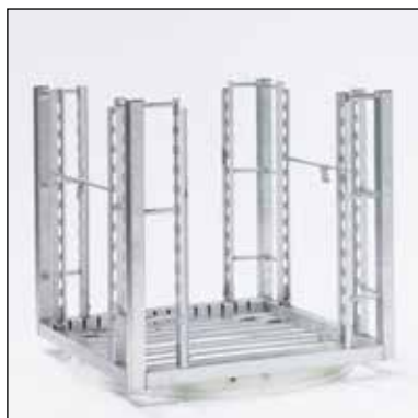
Square shaped cassette, part. no. 209.7276 Included in the delivery.