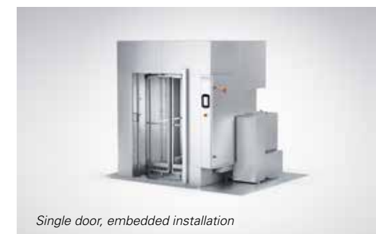
Single door, embedded installation

The machine can be installed in one of two ways. The first is to place the machine on the existing floor. This imposes no special requirements on the building. Ramps are then included in the delivery. In the case of new installations, it is better to have an embedded installation which requires a 200 mm deep pit in the floor, so that loading and unloading takes place at the same level as the floor of the building. This provides the best ergonomic solution, as some food distribution trolleys can be heavy.