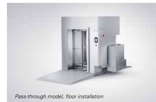
Pass-through model, floor installation

The machine can be supplied as a one- or two-door model, depending on the layout in the dishwashing area. The single-door version is suitable for narrow spaces, where loading and unloading are performed from the same side. When the layout permits the WD-18CW to have separate clean and dirty sides, the machine can be fitted with two doors, i.e. a pass-through machine.